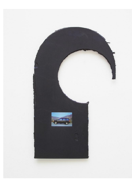
Martyn Reynolds, Black Hook Cherokee (2019), cast, anodized aluminium, UV print. Exhibited at Norma Redpath and Martyn Reynolds at Sydney, Sydney, 2019.