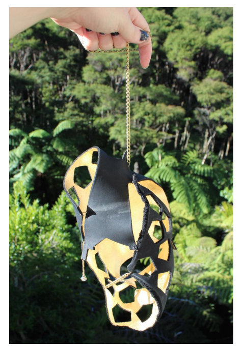
Sculpture production at the artist's mother's home in the Coromandel bush during a trip to New Zealand in 2016. The finished work, Bondage Jewel , was presented in Overseas BF , a show curated by Signe Rose that brought together works by European artists and New Zealand expat artists with local practitioners at Glove Box, Auckland, 2016.