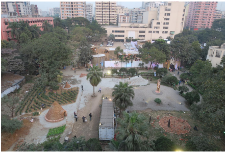
Dhaka Art Summit, February 2020.

Also, New Zealand is quite far away from a lot of the world, and so we have to travel anyway. People can either come to us or we go there, and fifty-times more people attend these international events.