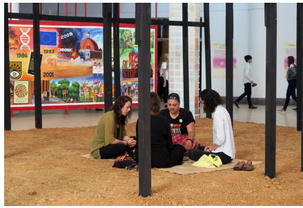
Mata Aho Collective at Dhaka Art Summit 2020: Seismic Movements, February 2020.