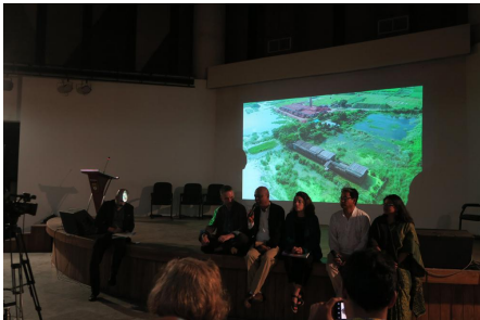
Design in the Era of Climate Catastrophe panel at Dhaka Art Summit, February 2020.