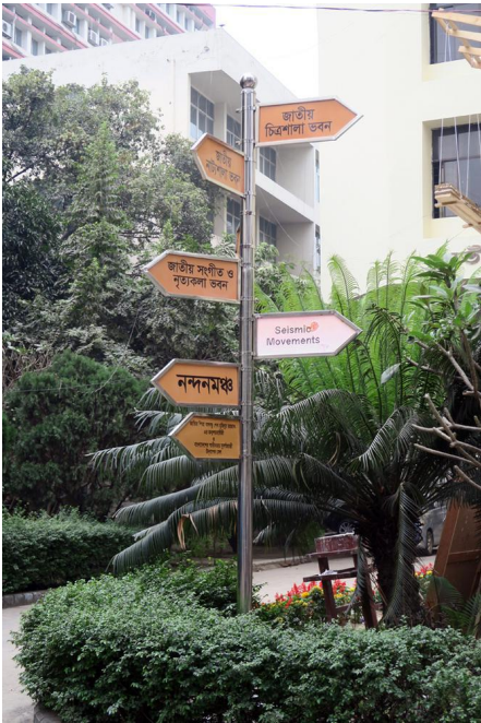
Dhaka Art Summit, February 2020.