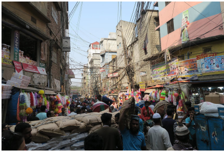
Dhaka, Bangladesh, February 2020.