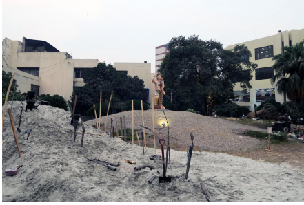
Dhaka Art Summit, February 2020.