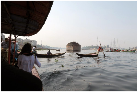
Dhaka, Bangladesh, February 2020.

PA What does it take for your collective to be here in Dhaka and participate in an event like this?