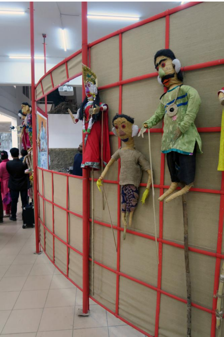
Dhaka Art Summit, February 2020.