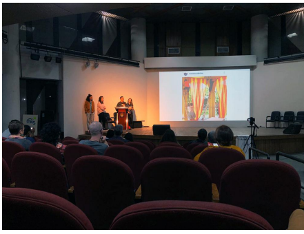
Mata Aho Collective speaking at Dhaka Art Summit, February 2020.