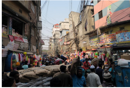
Dhaka, Bangladesh, February 2020.

Continuing to expand its geographical coverage, Contemporary HUM is pleased to bring you the third publication covering New Zealand's art activity in Asia. This first series of new publications engages with projects in Singapore, Hong Kong and Bangladesh.