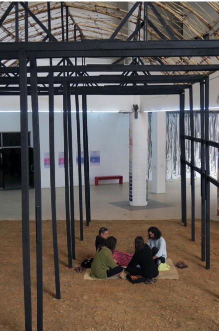
Dhaka Art Summit, February 2020.

Zealand. It's also been really affirming to be around so many collectives from all around the world.