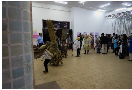
Dhaka Art Summit, February 2020.