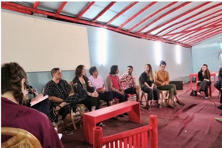
Mata Aho Collective speaking at Dhaka Art Summit, February 2020.

Because when we do waiata and practice customary things, that's not a performance either, it has a real practicality and plays a role. Either to support those who have spoken, or it's like a gift. When we travel, we've been able to stand and acknowledge people who've hosted us without giving physical gifts, but by singing to them. It's never a performance for us, in the Western ideology sense, and we're uncomfortable with the idea of being performative of our culture.