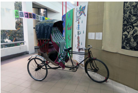
Dhaka Art Summit, February 2020.