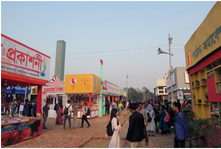
Dhaka Book Fair, Bangladesh, February 2020.