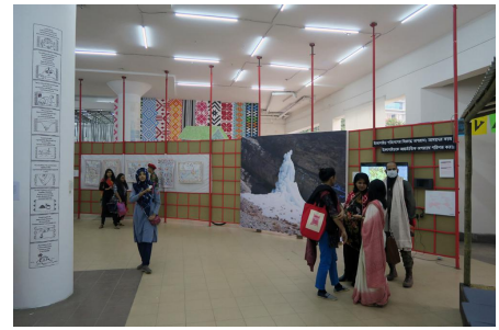
Dhaka Art Summit, February 2020.