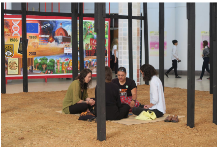
Mata Aho Collective at Dhaka Art Summit, February 2020.