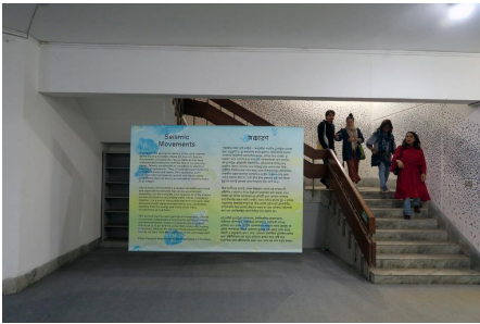
Dhaka Art Summit, February 2020.