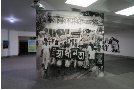
Photojournalist Rashid Talukder's photo of the arms drill by women members of the Chatro student union in 1971 greets visitors arriving at DAS 2020: Seismic Movements , February 2020.