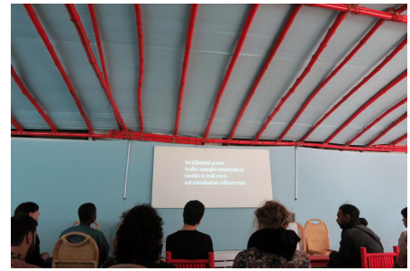
Dhaka Art Summit 2020: Seismic Movements, February 2020.