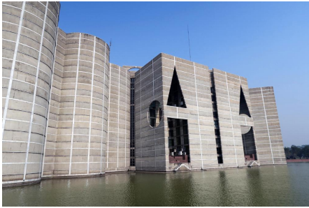
Louis Kahn's National Parliament of Bangladesh in Dhaka, February 2020.