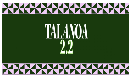
Forever Fresh Talanoa Series 2.2, 2022. Facilitated in collaboration with In*ter*is*land Collective.