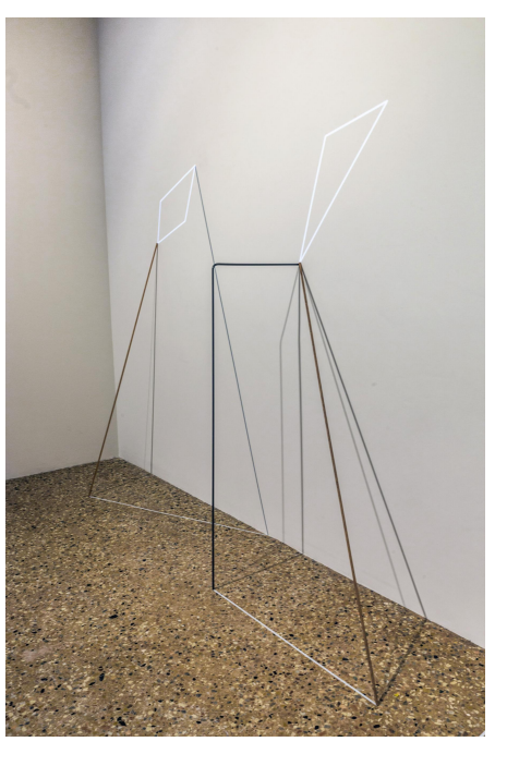
Kāryn Taylor, Field Notations, 2017. Personal Structures: Open Borders, Palazzo Mora, Venice.