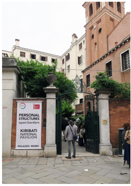
Personal Structures: Open Borders, Palazzo Mora, Venice.