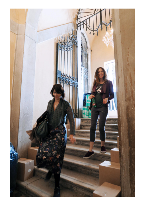
{\it Personal Structures: Open Borders, Palazzo} \\ {\it Mora, Venice.}

\begin{array}{ll} {\rm HUM} & {\rm How \, would \, you \, describe \, the \, work \, you \, are} \\ {\rm presenting \, here} \, \textit{Field Notations?} \end{array}