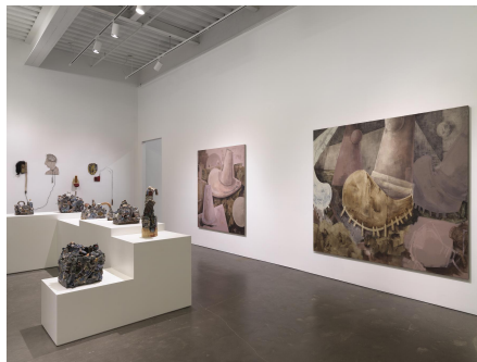
2021 Triennial: Soft Water Hard Stone , 2021. Exhibition view: New Museum, New York.

Dedicated to showcasing emerging artists from around the world, the fifth New Museum Triennial speaks to ideas of resilience and perseverance, and the impact that an insistent yet discrete gesture can have in time. In Soft Water Hard Stone, curators Margot Norton and Jamillah James bring together 40 artists whose work re-envision traditional models, materials, and techniques beyond established paradigms.