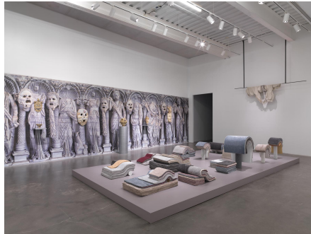
2021 Triennial: Soft Water Hard Stone , 2021. Exhibition view: New Museum, New York.