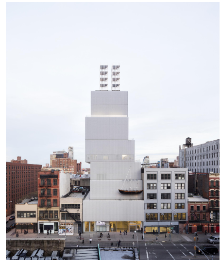
The New Museum in New York, designed by Tokyo-based architects Kazuyo Sejima and Ryue Nishizawa/SANAA.