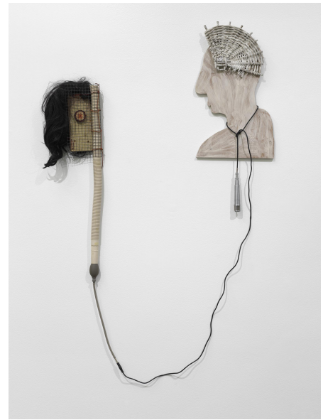
Blair Saxon-Hill, Emergency Contact (detail), 2021. Dimensions variable. Courtesy the artist and Nino Meier, Los Angeles. 2021 Triennial: Soft Water Hard Stone , 2021. Exhibition view: New Museum, New York. Photo: Dario Lasagni. Courtesy New Museum.