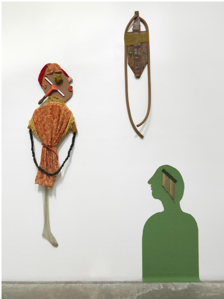
Blair Saxon-Hill, Emergency Contact (detail), 2021. Dimensions variable. Courtesy the artist and Nino Meier, Los Angeles. 2021 Triennial: Soft Water Hard Stone , 2021. Exhibition view: New Museum, New York. Photo: Dario Lasagni. Courtesy New Museum.