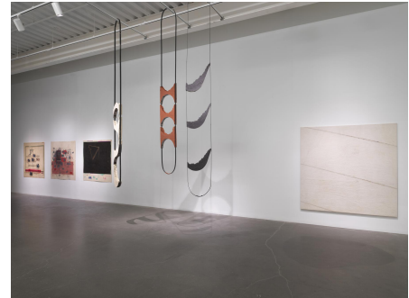
2021 Triennial: Soft Water Hard Stone, 2021. Exhibition view: New Museum, New York.