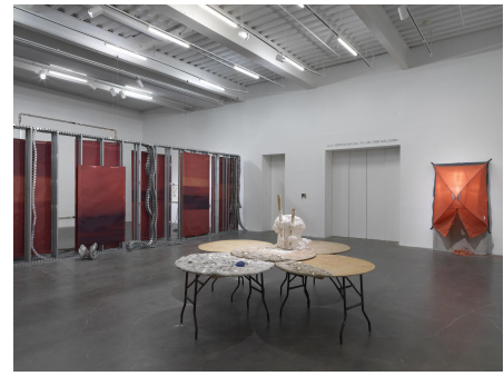
2021 Triennial: Soft Water Hard Stone , 2021. Exhibition view: New Museum, New York.