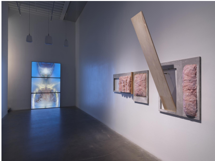
2021 Triennial: Soft Water Hard Stone , 2021. Exhibition view: New Museum, New York.