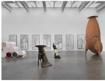
2021 Triennial: Soft Water Hard Stone , 2021. Exhibition view: New Museum, New York.