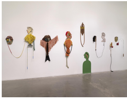
Blair Saxon-Hill, Emergency Contact , 2021. Dimensions variable. Courtesy the artist and Nino Meier, Los Angeles. 2021 Triennial: Soft Water Hard Stone , 2021. Exhibition view: New Museum, New York.